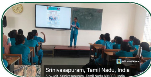
Srinivasapuram, Tamil Nadu, India Srinivasapuram, Tamil Nadu 631003, India